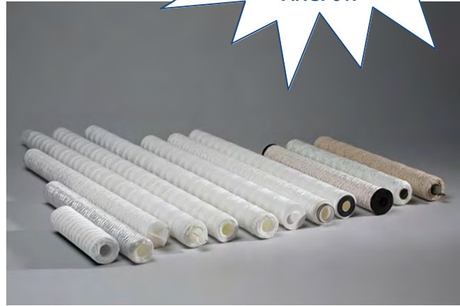
DW Series string wound filter cartridges are available in a variety of sizes and configurations

Midwest Filter's DW string wound filters remove solids from water, process fluids, and compressed gasses, providing economical solutions to protect processes, people, and the environment. These depth filters are available with numerous material options for filter media, cores, and core covers. A wide variety of end fittings enable proper fit into most single-round and multi-round filter housings. DW cartridges are available with nominal micron ratings from 0.5 to 200 in continuous lengths from 3" to 72" and diameters from 2" to 4.5". Optional core covers assure superior particle removal for critical applications. DW string wound cartridges are manufactured in Midwest Filter's West Chicago filtrations headquarters with high-speed winding machinery, producing precise diamond patterns which define the micron ratings. From pre-filtration to polishing applications, for potable water to aggressive chemicals, DW string wound filters by Midwest Filter, provide the progressive depth filtration with high sediment holding capacity demanded by the industry.